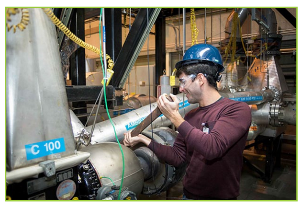
Advanced Technological Education Program

National Science Foundation, Deadline: October 15, 2018