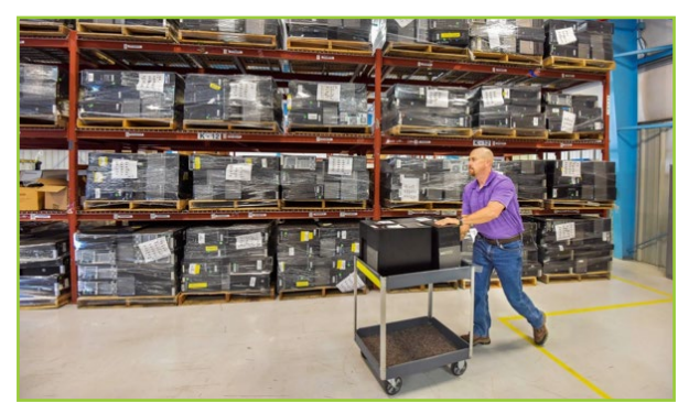
Sandia Gears Up for Annual Computer Donation Event

Students from more than 40 New Mexico schools are expected to benefit from Sandia National Laboratories' annual K-12 Computer Donation Event next week, where more than 1,000 computers and related accessories will be distributed. Representatives from schools around the state will collect the computers for students, along with printers, power cords, keyboards, mice, headphones, monitors, and speakers. Last year, tablets were distributed to schools for the first time, and Sandia plans to donate more this year.