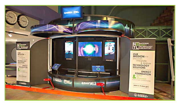
NETL and the Carnegie Science Center Renew Energy Zone Alliance with Major Exhibit Improvements

There's an old proverb: "if you are planning for a year, sow rice; if you are planning for a decade, plant trees; if you are planning for a lifetime, educate people." NETL and the Carnegie Science Center are planning for a lifetime with an updated version of a popular Science Center fixture known as the NETL Energy Zone exhibit.