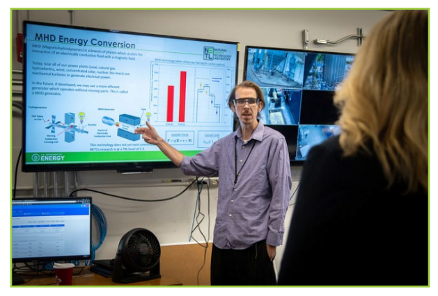
Meeting America's Energy Challenges